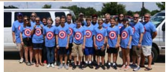
Junior High Mission Trip