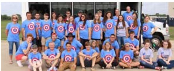
Senior High Mission Trip